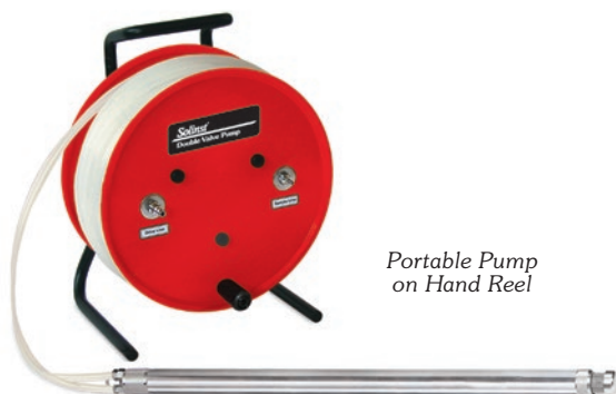
Portable Pump on Hand Reel

For less frequent sampling, reel mounted portable systems allow access to multiple monitoring wells, even in remote locations. The reel mounted portable units are free-standing with a convenient carrying handle. They can be made for almost any size or depth of application.