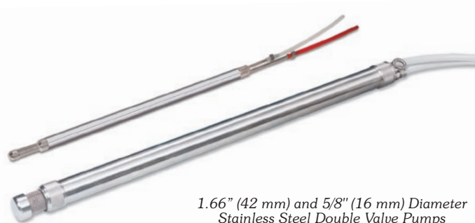
1.66" (42 mm) and 5/8" (16 mm) Diameter Stainless Steel Double Valve Pumps