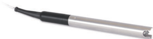
Model 122M P8 Probe

The 122M uses the P8 Probe, which is 5/8" in diameter (16 mm) and stainless steel. It is pressure proof, up to 500 psi. The beam is emitted from within a Hydex cone-shaped tip. The tip is protected by an integral stainless steel shield, and is excellent for the vast majority of product monitoring situations.