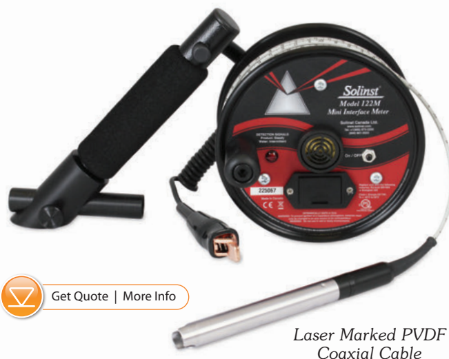
Laser Marked PVDF Coaxial Cable

Model 122 is approved for use in hazardous locations Class I, Div 1, Groups C&D based on CSA Standards and is ATEX certified under directive 94/9/EC as II 3 G Ex ic IIB T4 Gc